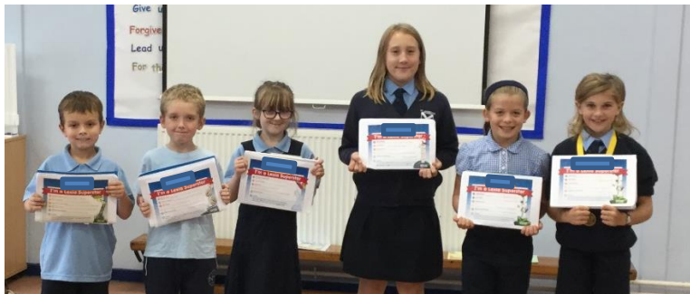
The Year 4 girls below came 4 th place in their cross-country race. Well done!