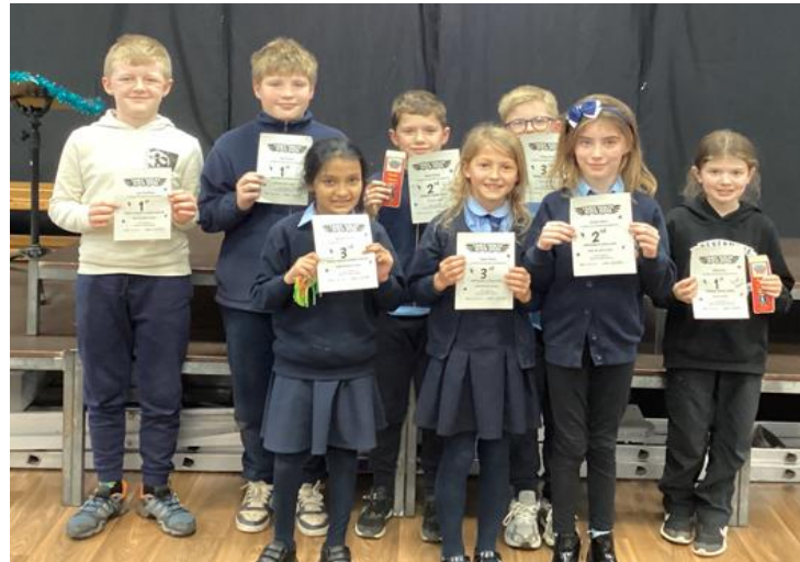
Willow and Oak Class children showing their fire engine models